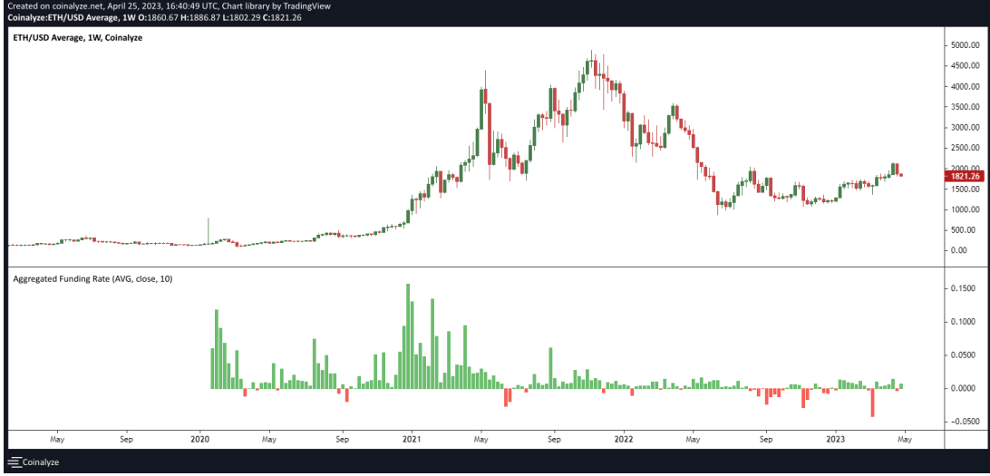
Figure 2: ETH Funding Rate - Positive rate indicates greater demand for longs than shorts