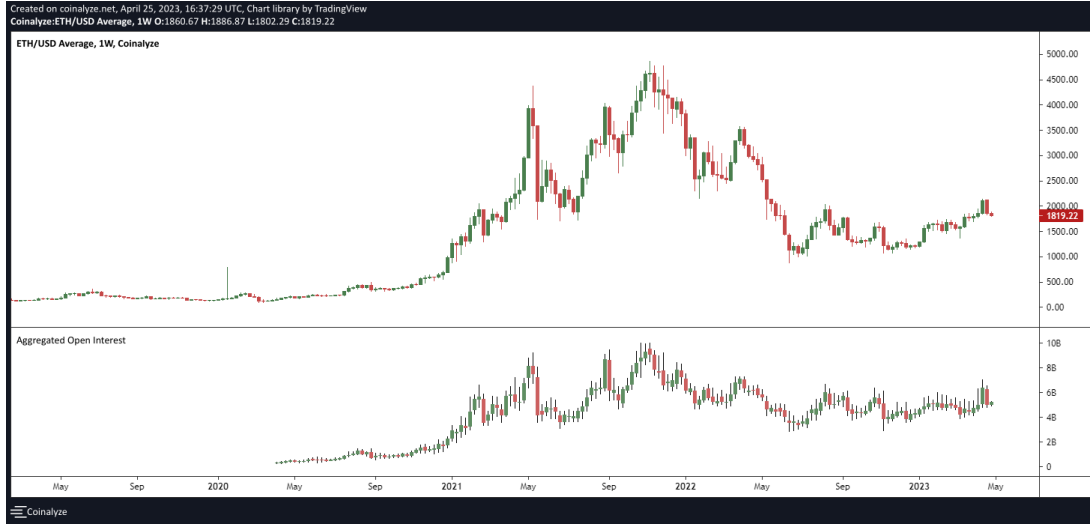
Figure 1: ETH open interest since 2020